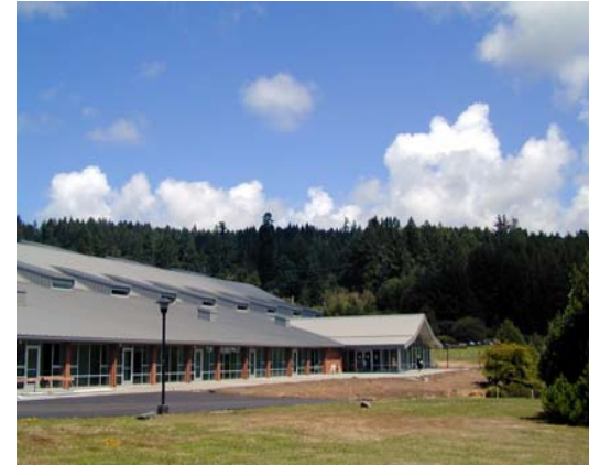
New Learning Resource Center Eureka Campus

Nondiscrimination/Equal Opportunity: College of the Redwoods is committed to equal opportunity in its employment and encourages application from underrepresented group members (women, minorities, persons with disabilities, and Vietnam-era veterans).