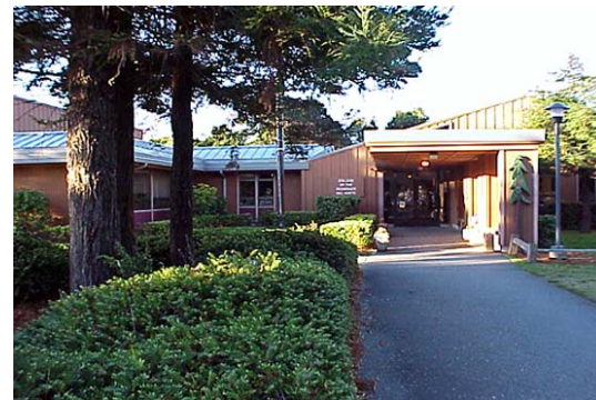
Del Norte Campus