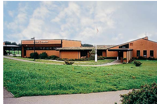
Mendocino Coast Campus