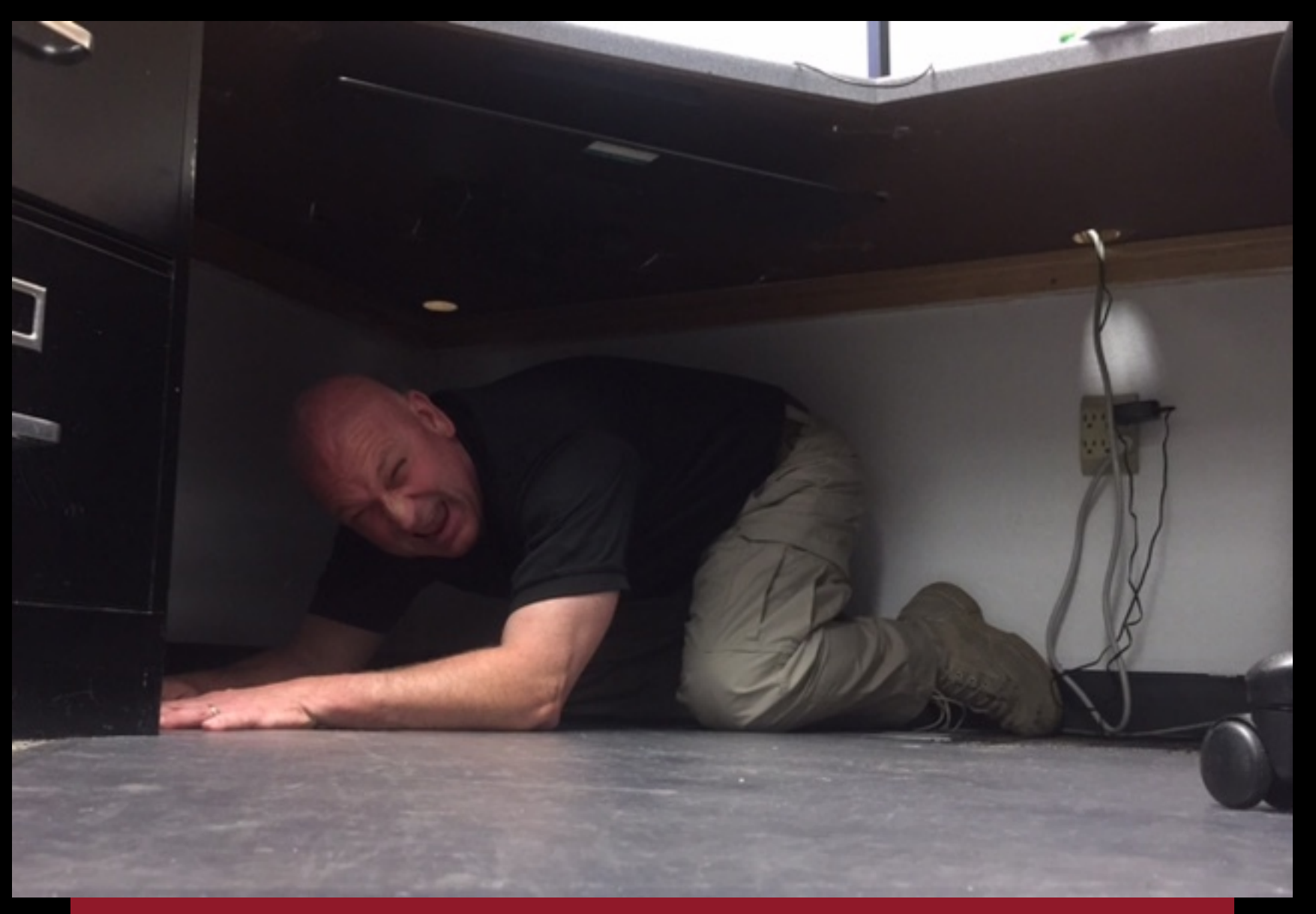
We are the people we've been waiting for."