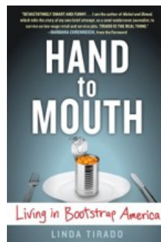
picture of course text hand to mouth 1