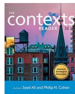
picture of course text Contexts reader 3 1