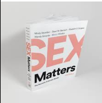
picture of course text Sex Matters 5 th edition